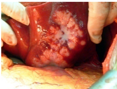
Fig. 4: Metastases of Segment II and III of the liver

Resection of the anterior abdominal wall Resection of the Sigmoid and reanastomosis of the colon. Resection of 50% of the urinary bladder. Resection of Segment II and III of the liver. Intraoperative cryotherapy of the liver metastases in the right liver