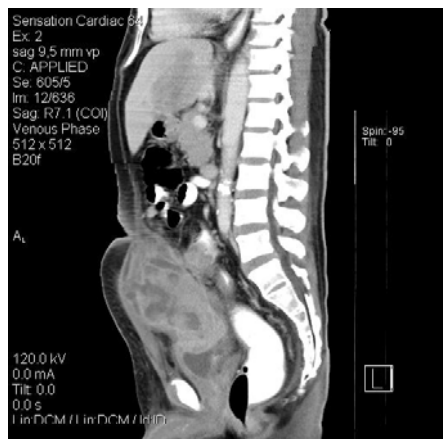
Fig. 3: CT scan: intraabdominal mass infiltrating into the roof of the urinary bladder