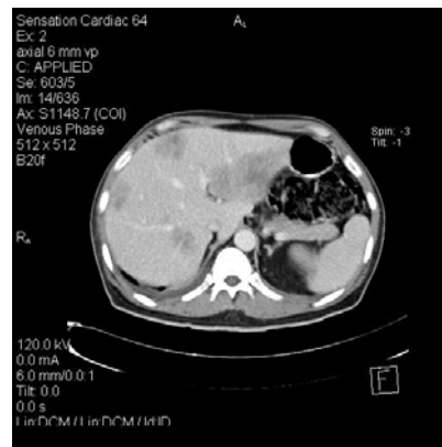
Fig. 2: CT scan: multiple lesions in all segments of the liver