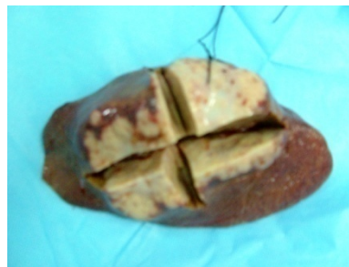
Fig. 5: resected specimen of the Segment II and III left Liver