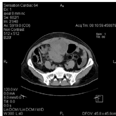
Fig. 1: CT scan: abdominal mass infiltrating into the anterior abdominal wall

Sigmoid with intraluminal mass infiltrating the colonic wall, the adjacent anterior peritoneum and the wall of the urinary bladder. Tumor infiltrating the rectus muscle and the retroperitoneum from the height of L3. Ventral tumor mass infiltrating the abdominal wall from the umbilicus to the pelvis.